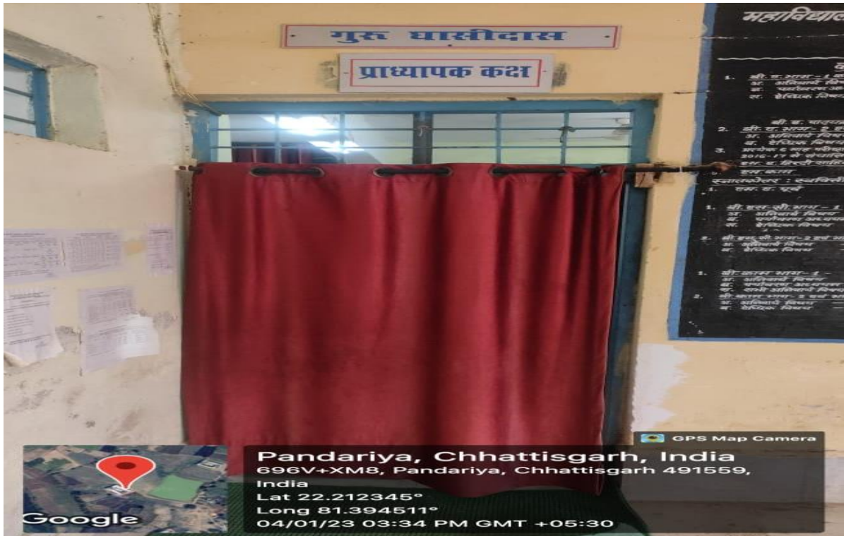
Pic: - Professor's staff room for the help desk of disabled persons help desk.